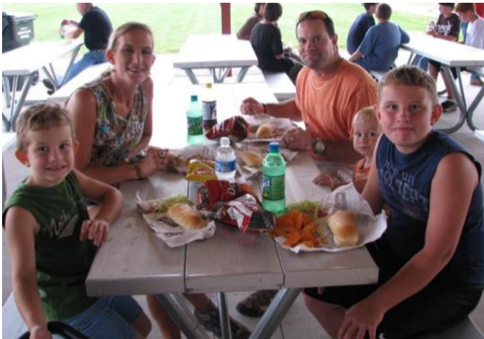
WNC SUPPORTER!! - A family eating Milio's Subs!