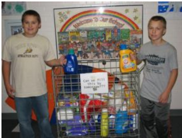
Intermediate students collected a bin full at their school