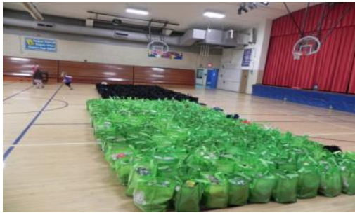
240 Christmas Meals - Ready to Go!